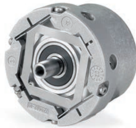
AEF/ECN/ERN 1300 series (plug-in PCB) and ECN/ERN 400 (cable connection) with expanding ring coupling (with high natural frequency of the stator coupling)

Encoders with EnDat interface (purely digital or with analog signals) offer the option of retrieving encoder parameters and predefined characteristic values of the motor and brake from an internal EEPROM. This can shorten commissioning times and prevent input errors when entering parameters of the drive system. In addition, EnDat encoders offer the possibility of electronic position adjustment (zeroing). Thus, the absolute position value of the encoder can be adjusted to the orientation of the motor rotating field, eliminating complicated mechanical alignment. Depending on the encoder, diagnostic functions such as temperature evaluation and valuation numbers are available for assessing the encoder's functional reserves. When critical values change, preventive measures can be taken in order to avoid unscheduled maintenance of the elevator.