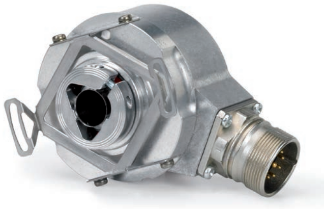
EQN 400 series

A bearing assembly with an EQN 400 is offered specifically for shaft resolution. The cabin position is often measured through toothed belts and deflection pulleys. The bearing assembly decouples the large forces that often occur here from the precision bearing of the rotary encoder, thereby preventing an overload on the encoder.