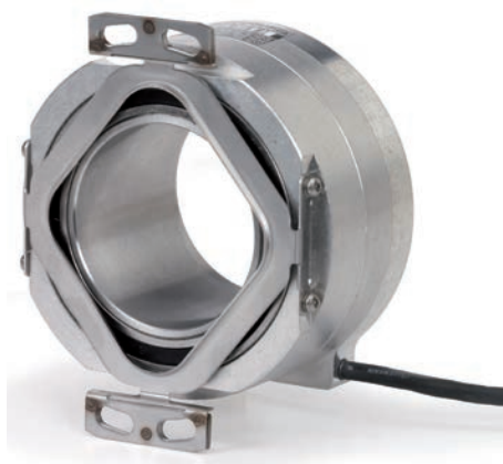
ECN/ERN 100 series Hollow shafts with inside diameters up to 50 mm