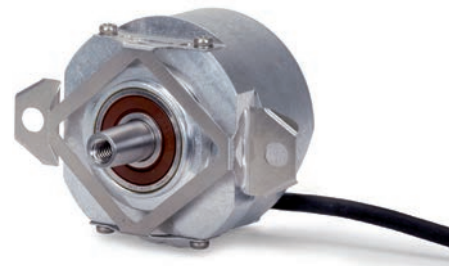
AEF/ECN/ERN 1300 series (plug-in PCB) and ECN/ERN 400 (cable connection) with plane-surface coupling (expanded running and mounting tolerances)