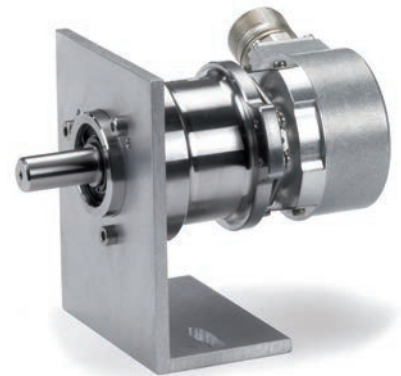
Bearing assembly with EQN 400

Shaft load up to: Axial 150 N Radial 350 N