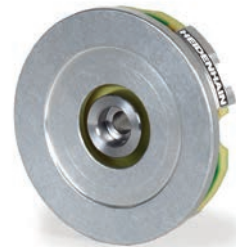
ECI/EBI 1100 series